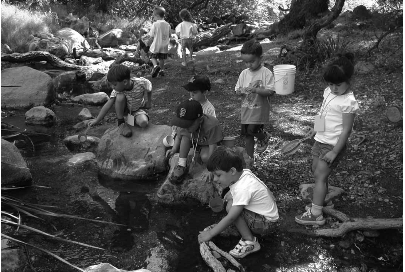
As part of a Youth Science Institute (YSI) program, first-grade students explore aquatic plants and animals in a Northern California creek. YSI was a grantee of the Environmental Solutions Forum, which built a regional network of environmental educators.

Our consulting firm evaluated ESF over four years, conducting more than 60 interviews, observing dozens of programs, assessing organizational capacity at baseline and follow-up, collecting data on more than 50 programs, and comparing these programs with best practice standards for environmental education. Our evaluation reveals that ESF built many strong, effective, and efficient environmental organizations, rather than just creating lone pockets of excellence. The fund also cultivated a vibrant, fast-acting network and leveled the hierarchy between funders and grantees. Together, these organizations are improving stewardship of the environment throughout the San Francisco Bay Area. We conclude that venture philanthropy has the potential to strengthen entire fields, leading to long-term and sustainable social change.