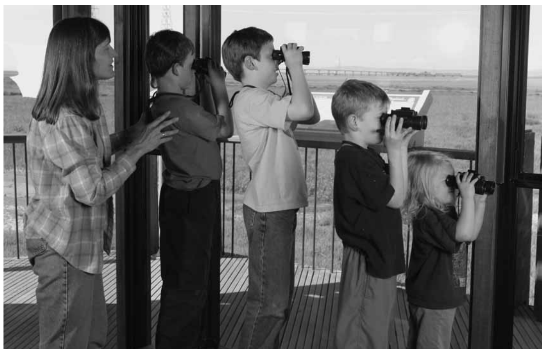
At the Lucy Evans Baylands Nature Interpretive Center, a naturalist helps children identify birds above the San Francisco Bay. Fellow Center for Venture Philanthropy grantees helped the center through a budget crisis.

and money, but also boosted the society's confidence in choosing a more expensive yet more effective system.